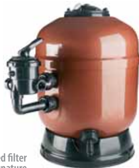
Laminated filter AstralPool Signature