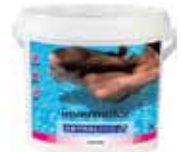
CLEANING, FLOCCULANTS AND COMPLEMENTARY PRODUCTS