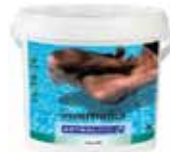
ALGAECIDES AND WINTER CONDITIONERS